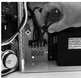
Connect speaker wires to terminal screws. (see Fig. 1). Connect the black wire to the terminal labeled Speaker - . Connect the white wire to the terminal labeled Speaker + .