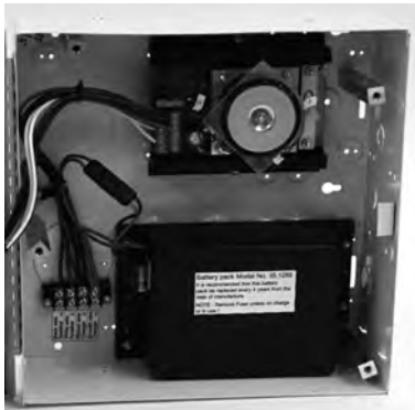
Mount the unit to the wall using pre-drilled holes.